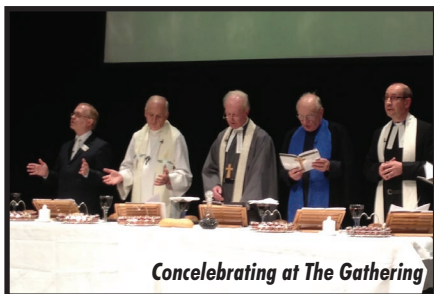
Concelebrating at The Gathering

Conversations are on-going concerning how churches may witness and minister around the possible provision of a Rural Christian Centre at the Royal Agricultural Society's showground at Builth Wells. Cytûn offers thanks for the good working relationship that has been established with the Society and Christian partners. The work of the rural chaplains is greatly appreciated.